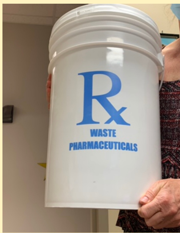
Our medication waste container

The medication container now has a label that encourages the separation of cardboard and waste from the medications. A copy is attached.